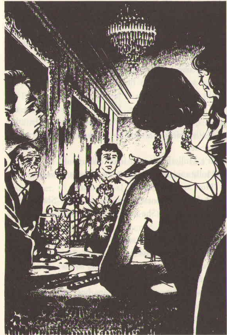
‘The table looks nice, Jackie. What wonderful flowers!’ Diane said.

‘The table looks nice, Jackie. What wonderful flowers!’ Diane said. She was a beautiful girl, with long