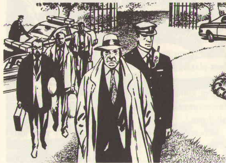
A lot of police arrived very quickly.

'Good morning. I am Detective Inspector Walsh and this is Sergeant Foster.' The Inspector did not smile. He