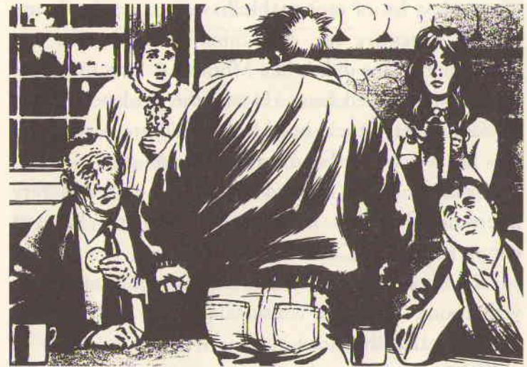
'Peter Hobbs was very angry about a letter.'

'Good. Tom Briggs came into the kitchen, too. Are you going to talk to him?'