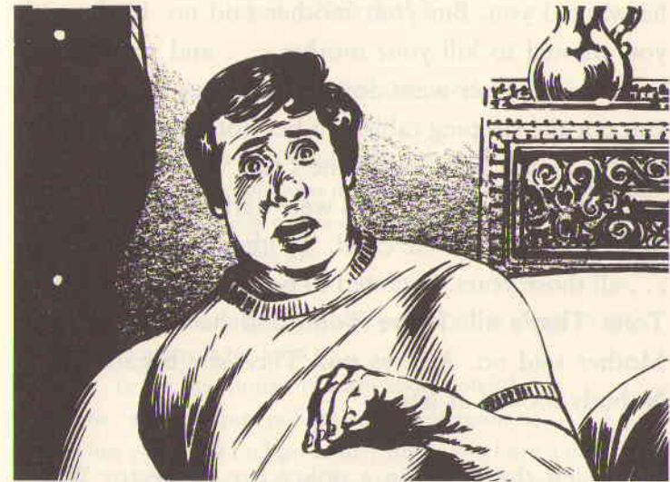
Jackie asked, 'What about Diane? You found the empty bottle in her bag.'

'No. We found the empty bottle in Diane's room.'