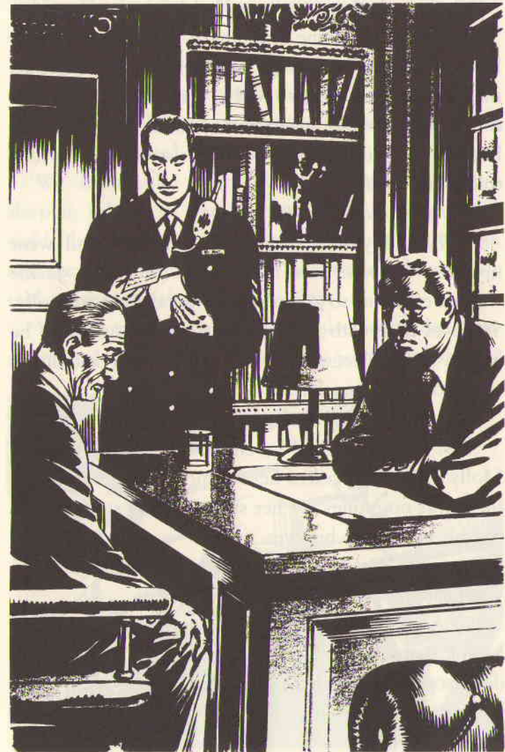
'Sergeant Foster is going to write it all down.'

'Tell me about last night,' Inspector Walsh asked quietly. 'You were angry with Mrs Clarkson.'