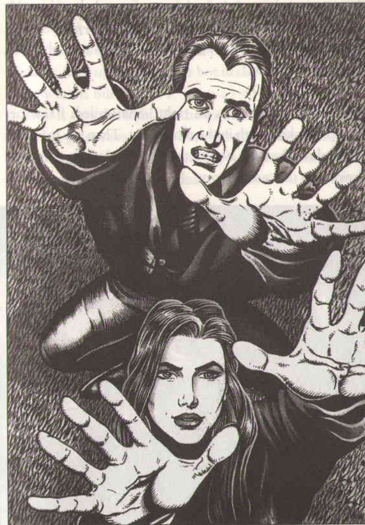
They held their hands and faces up to the moon.

'Who knows?' Dan said. 'On tour, I think – he took drugs, didn't he? No one can cure AIDS – not yet. But one