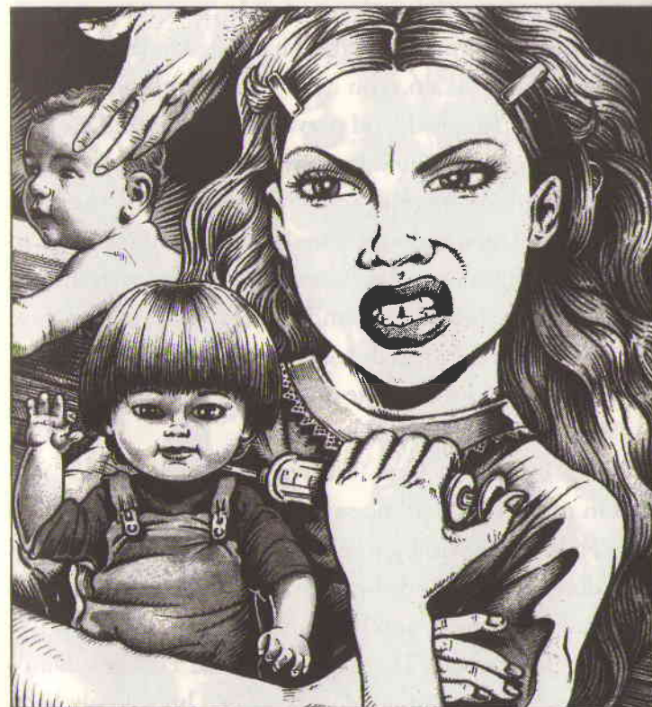
I put water in the syringe and pushed it into the dolls.

I was a good girl at school, and I was beautiful too, so I