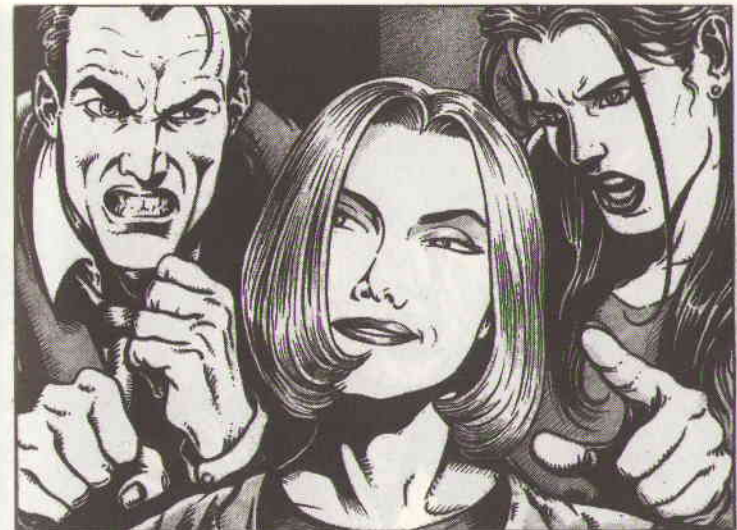
'Al's dead!' they shouted. 'You killed him!'

'Al Shore was dead,' my lawyers say, again and again. 'He was already dying of AIDS, and then he took a dangerous sleeping drug. Either he took the drug himself, or the Futures gave it to him. And then the Futures put him in a freezer and froze his body to -196^{\circ} Celsius. Nobody can stay alive when they're just a piece of ice. So