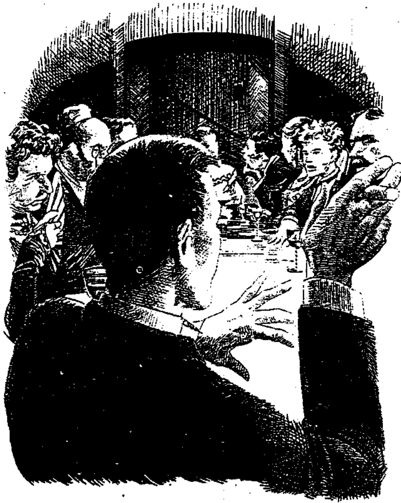
Dorian Gray never took his eyes away from Lord Henry.