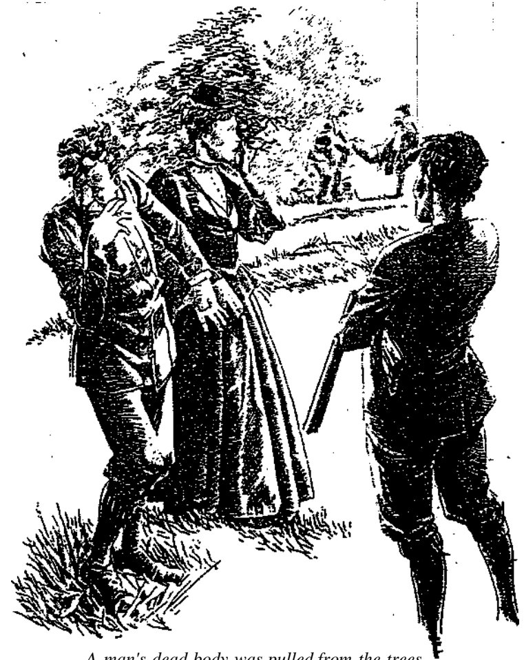
A man's dead body was pulled from the trees.

There were shouts and calls from the men, and then a man's body was pulled from the trees. Dorian turned away in horror. Bad luck seemed to follow him everywhere.