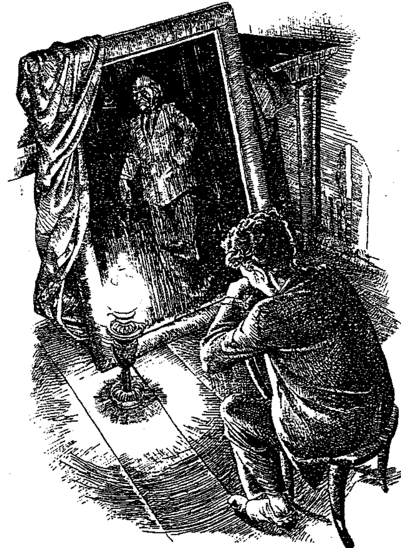
As time passed, the face in the picture grew slowly more terrible.

But behind the locked door at the top of the house, the picture of Dorian Gray grew older every year. The terrible face showed the dark secrets of his life. The heavy mouth, the yellow skin, the cruel eyes - these told the real story. Again and again, Dorian Gray went secretly to the room and looked first at the ugly and terrible face in the picture, then at the beautiful young face that laughed back at him from the mirror.