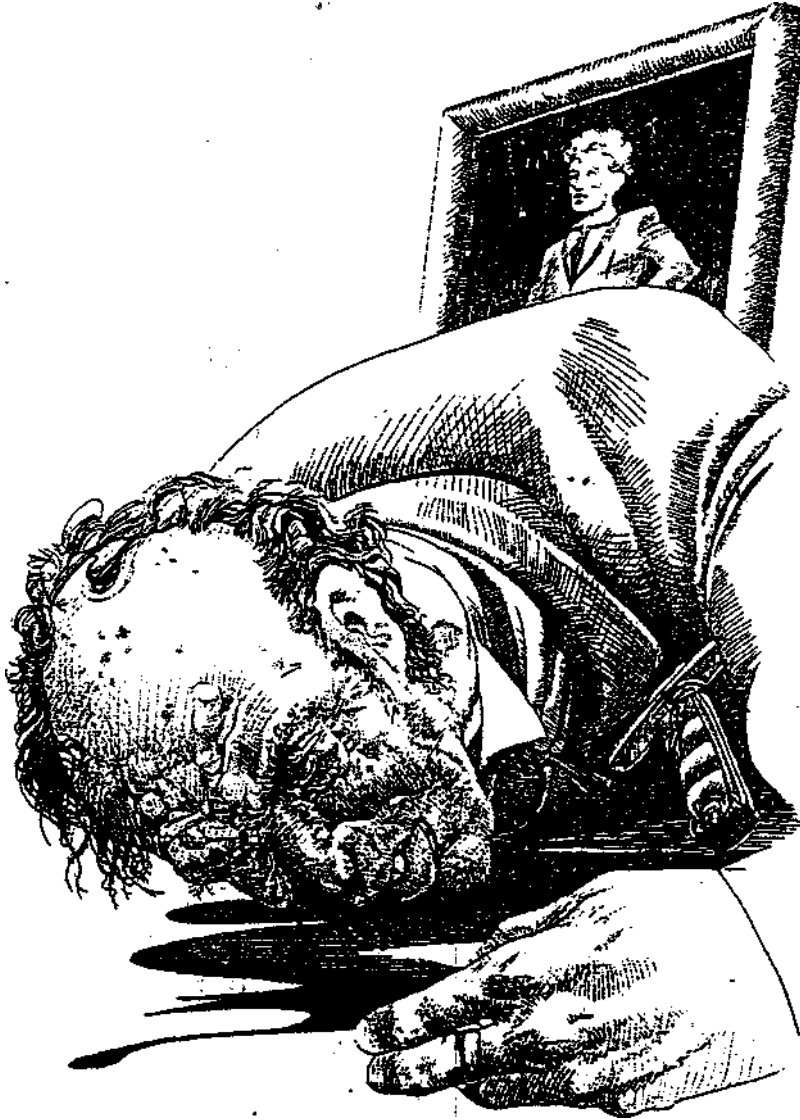
Lying on the floor was a dead man, with a knife in his heart.

They could not open the door, so they climbed down from the roof and got in through the window.