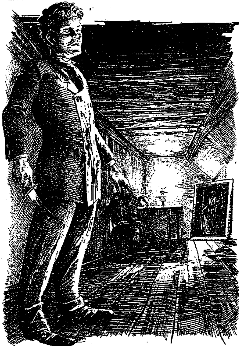
Dorian stood and listened. He could hear nothing — only the drip, drip of blood onto the floor.

again. The murdered man's head fell forwards, and the blood ran slowly across the table, and down onto the floor.