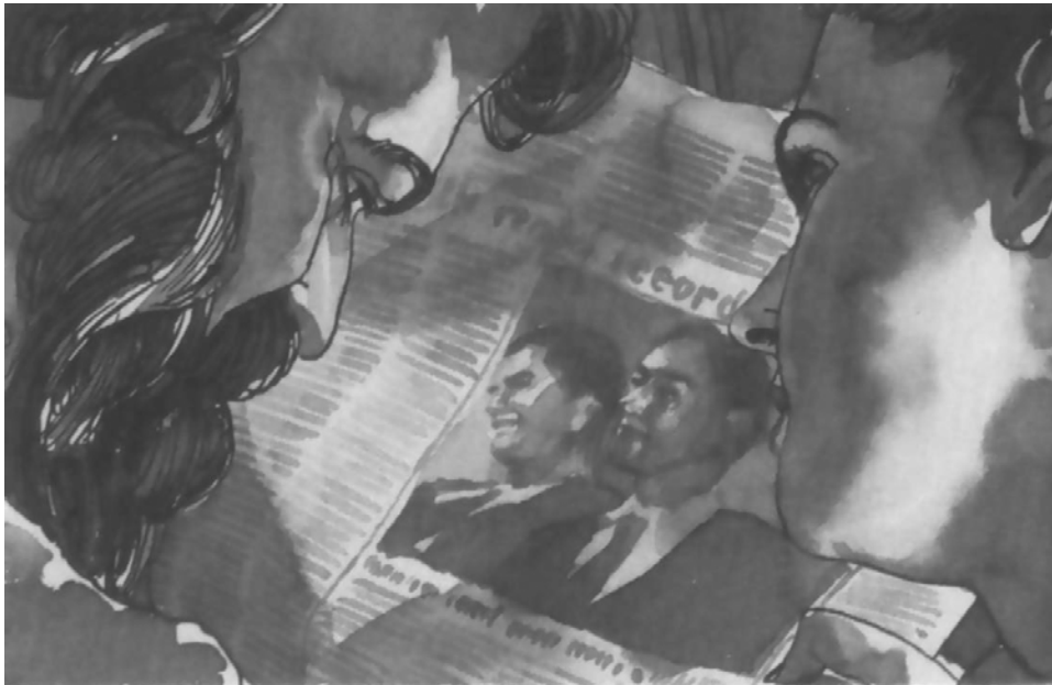
The hijacker looked at the photo, and then at Carl.

In one of his pockets she found a newspaper. She looked at it and saw the photo of Harald and Carl. She stood up slowly and showed it to the bearded man. He looked at the photo, and then he looked at Carl carefully and for a long time. Very slowly appeared on the faces of the two hijackers and they began to laugh.