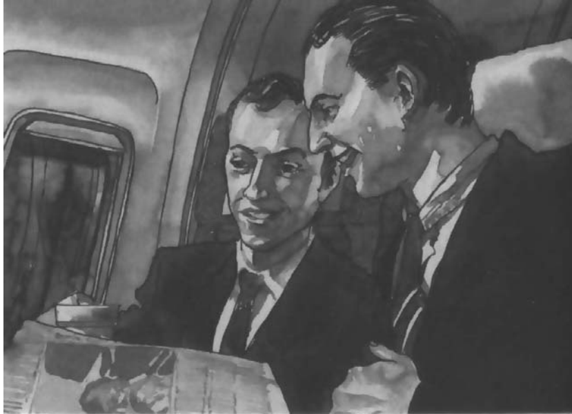
‘I’m just a police officer.’

Harald laughed. ‘You’re the famous man, sir, not me,’ he said. ‘I’m just a police officer. It’s my job to take care of you. That’s photo of you, not me.’